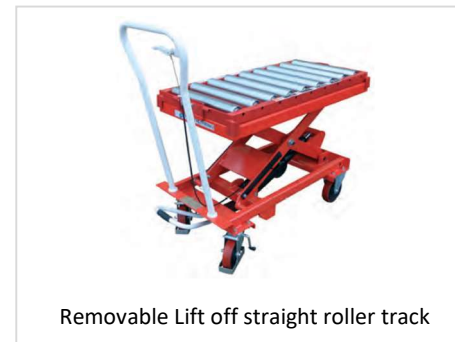
Removable Lift off straight roller track