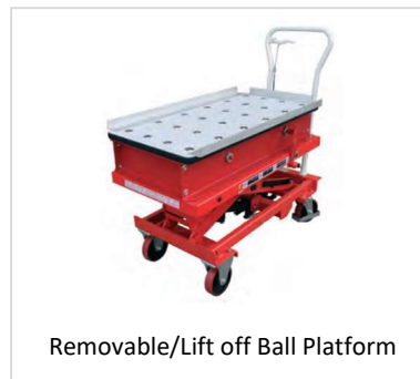
Removable/Lift off Ball Platform

Optional Extras available to suit on request: